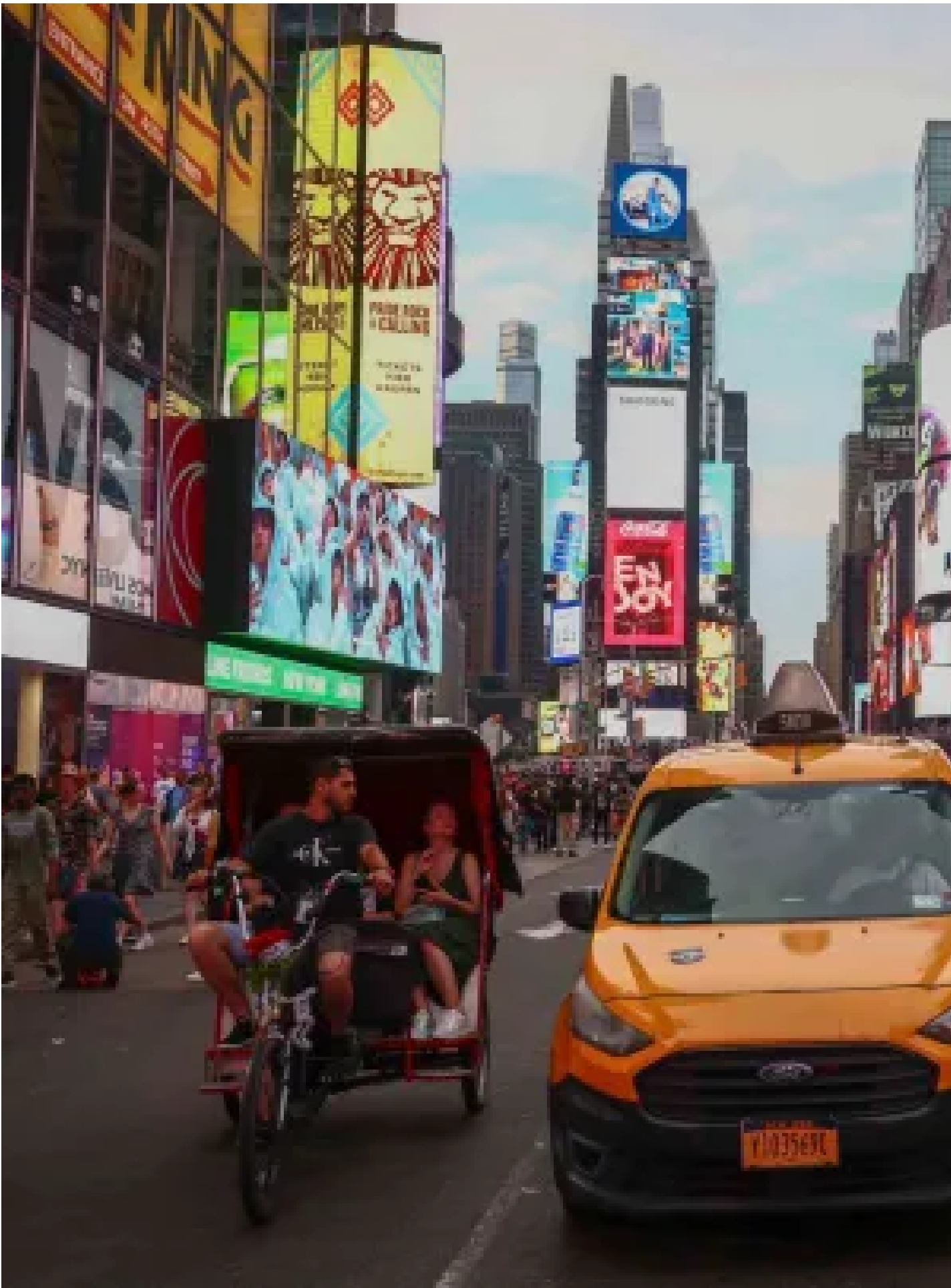
2024 7 4  200-500